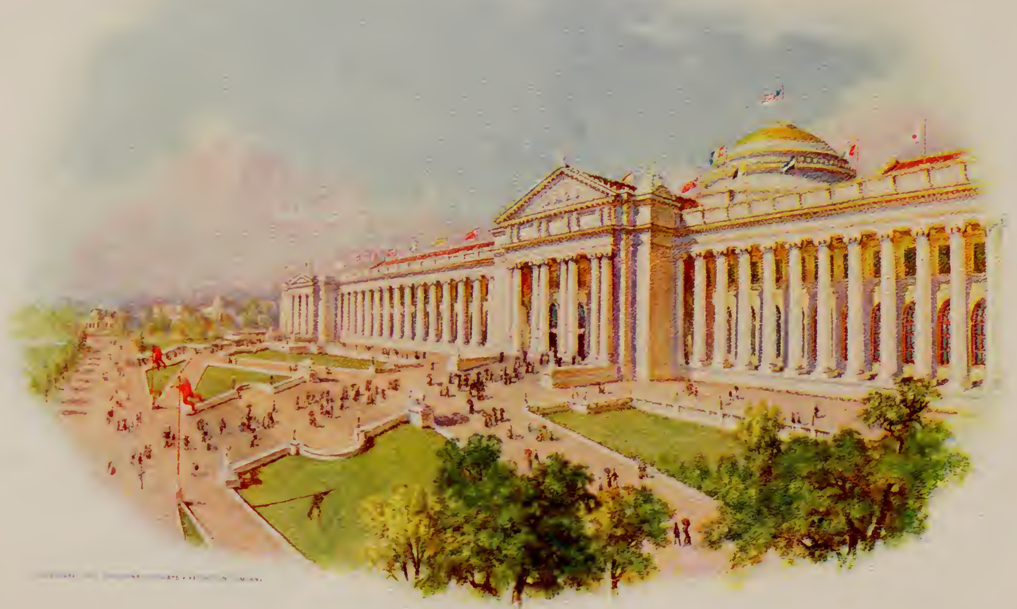
U. S. GOVERNMENT BUILDING